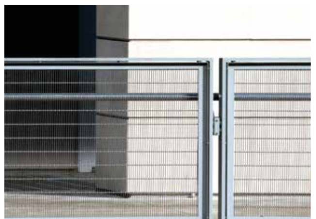
Title + image 4: The Art Institute of Chicago, Illinois, architect: Renzo Piano, France, mesh: PC-Tigris