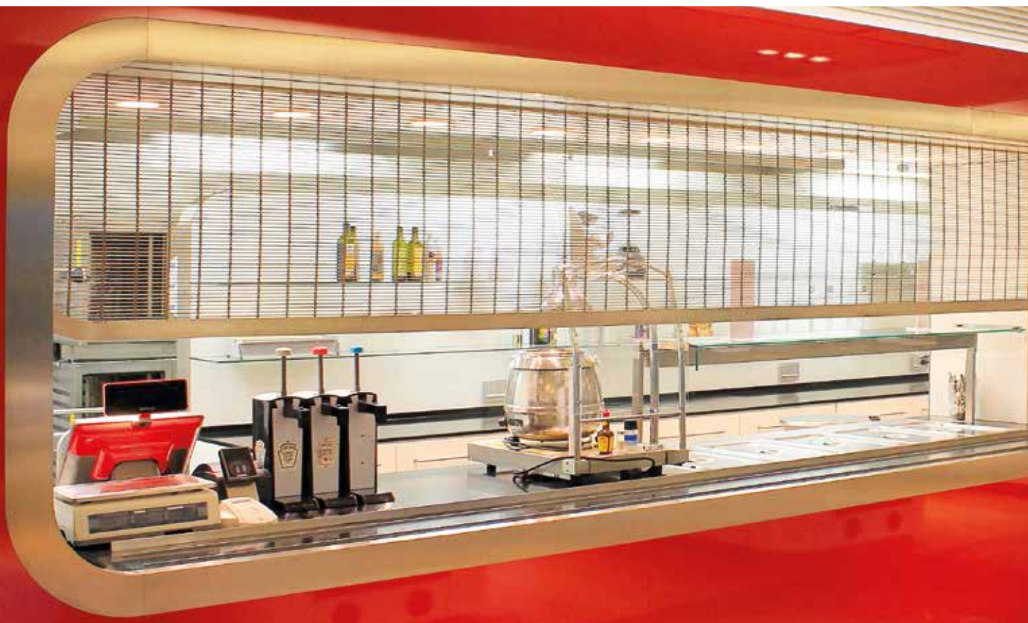
Roller shutter in a canteen, Münster, architect: Vervoorts & Schindler Architekten, Bochum, mesh: Tigris

all common building management systems. Depending on the model chosen, the systems are suitable for indoor or outdoor use. Thanks to their transparent appearance, our GKD metal meshes grant a view of the areas they cover and thereby help create an overall sense of space. A matched lighting concept allows these transparent aesthetics to be emphasised even more. The degree of transparency can be individually defined based on the density of the mesh used. As a system